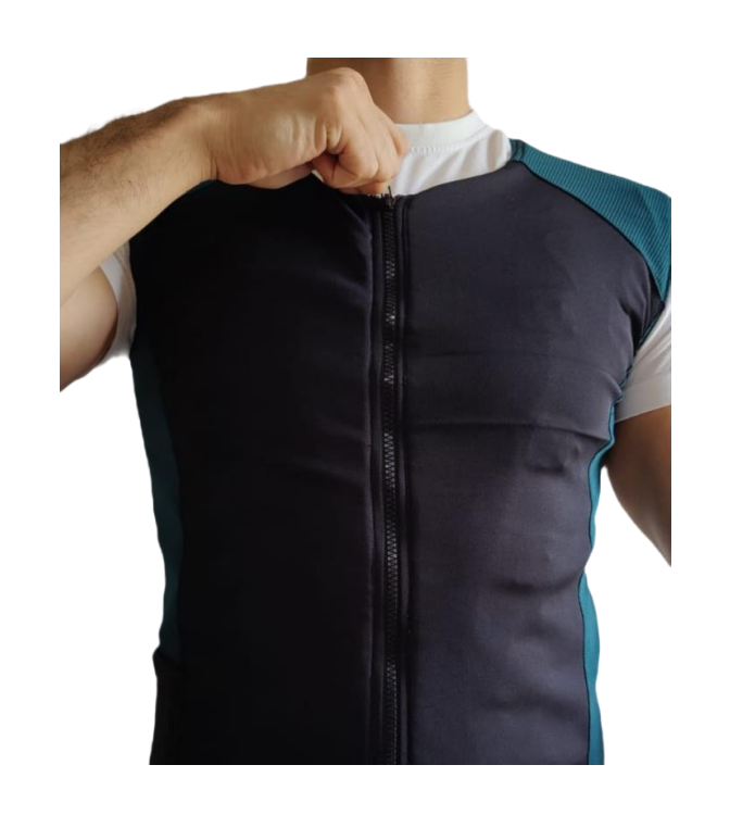
Zip up the jacket to the top